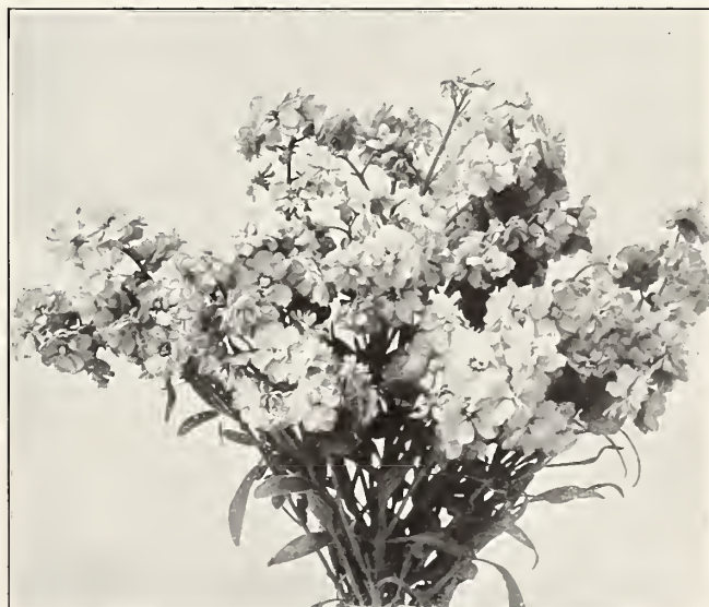
STOCKS—EARLY BRANCHING NICE